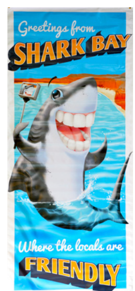
Overall Winner and Best Professional/ Digital: