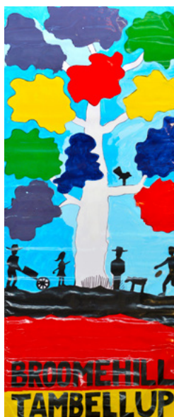
Best Upper Primary School: