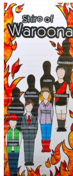
Best Community Group/ Non-professional