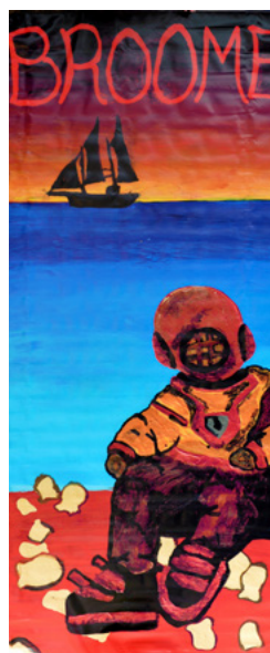
Best Secondary School: