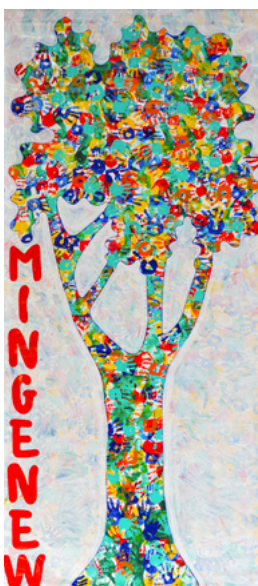
Best Junior Primary School: